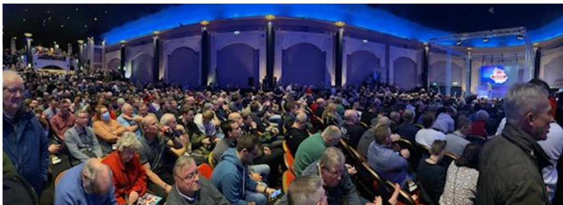
The Mac King lecture audience!