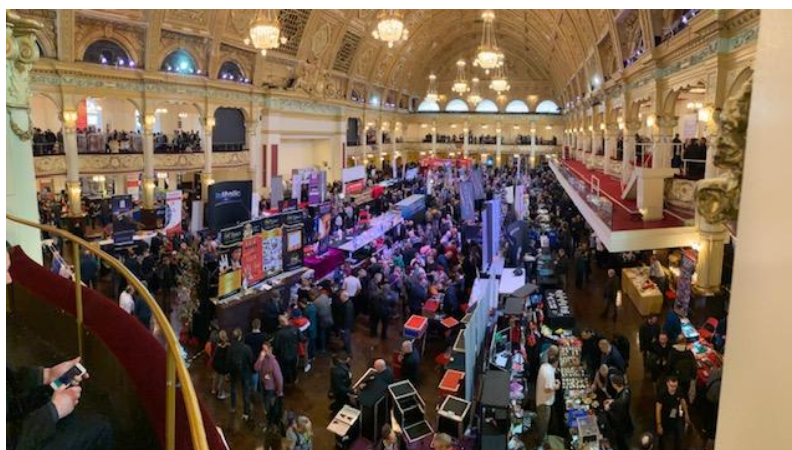
The huge dealer room.

At the last count we think there were around 15 or more Southend Sorcerers members at the convention, so we were certainly flying the flag for our part of the world. If you attended, let us know what your favourite parts were; and what you spent your hard earned money on! Also, do let us know if you're planning to go next year as it would be great if we could arrange a meet up somewhere.